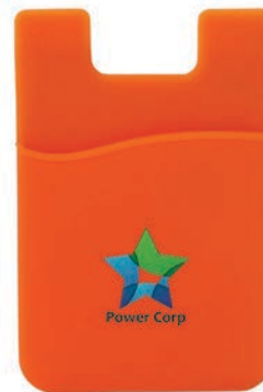
EZ847 (4" W x 7" H)