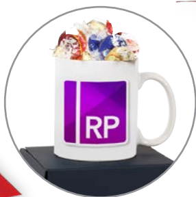
Mug & Lindt Lindor Balls in Soft Touch Box Refer to Pg. 147