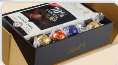
Reusable box with magnetic closure.