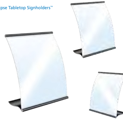
Eclipse Tabletop Signholders™