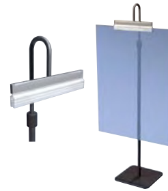
4" extruded plastic gripper

Different holders are available to meet your client's specifications.