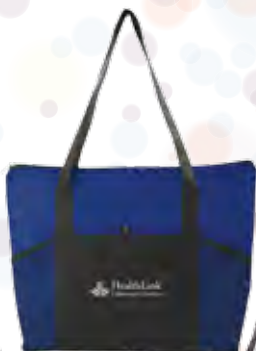
B587BL | Blue

Lead-safe fabrication according to accepted test standards