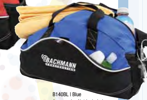
B140BL | Blue Accessories Not Included