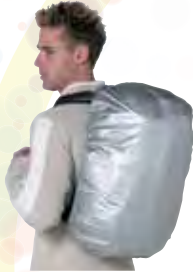
B811 | Rain Protected