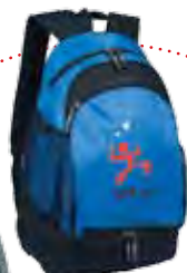
SFB110BL | Blue