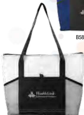
B587WH | White