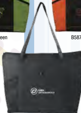
B587BK | Black