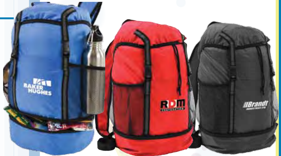
B130BL | Blue Accessories Not Included