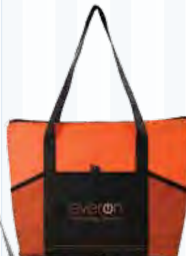
B587OR | Orange