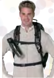
B811 | Harness