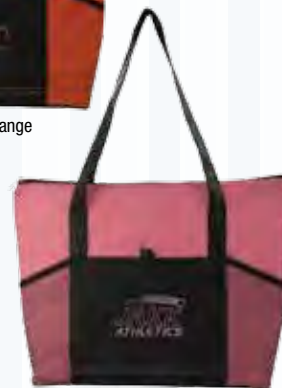
B587PI | Pink

SET-UP CHARGES: $50(C) includes 1 location/ 1 colour imprint