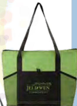
B587GN | Green