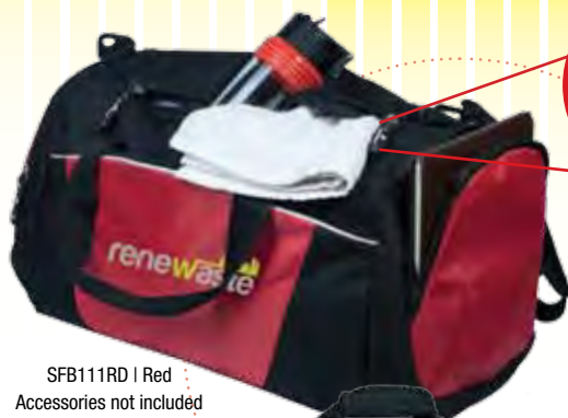
SFB111RD | Red Accessories not included