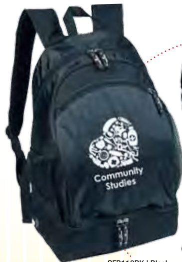
SFB110BK | Black