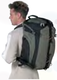
B811 | Backpack