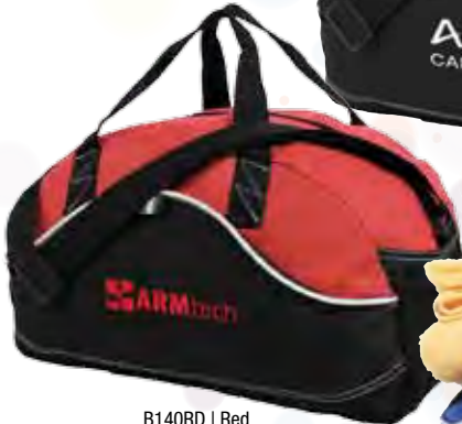
B140RD | Red