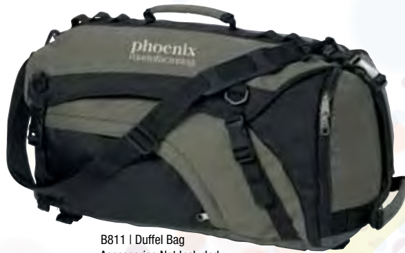
B811 | Duffel Bag Accessories Not Included