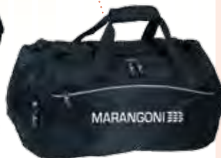
SFB111BK | Black

Swiss Force zipper pull Ripstop material