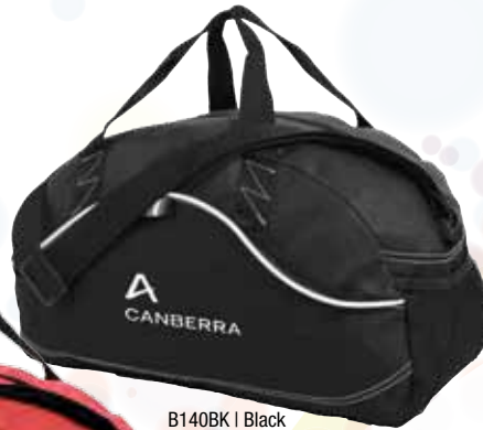
B140BK | Black

Lead-safe fabrication according to accepted test standards