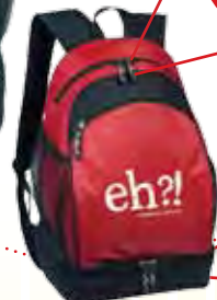
SFB110RD | Red