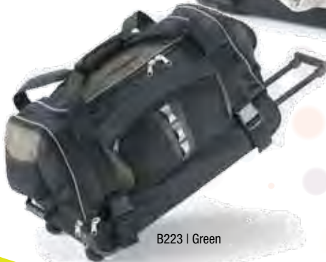
B223 | Green