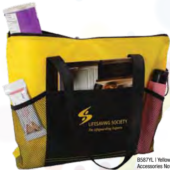
B587YL | Yellow Accessories Not Included