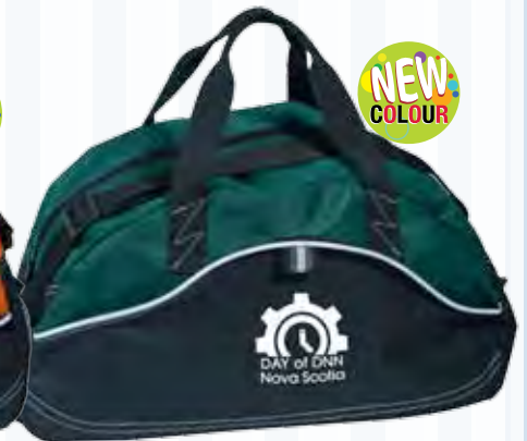
B140HG | Hunter Green

SET-UP CHARGES: $50(C) includes 1 location/ 1 colour imprint