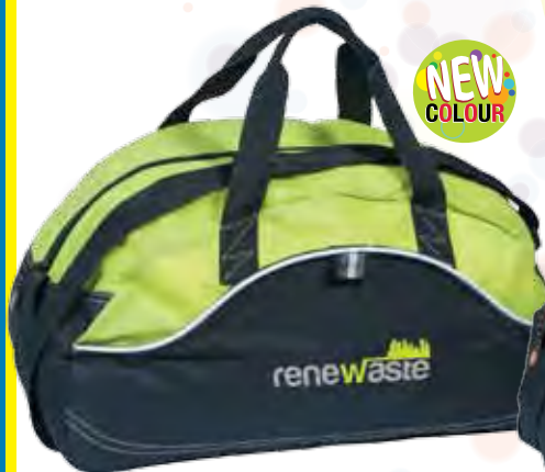
B140LG | Light Green