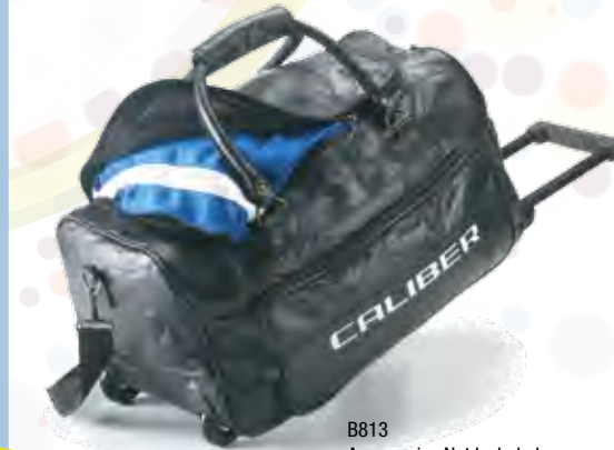
B813 Accessories Not Included

SET-UP CHARGES: $50(C) includes 1 location/ 1 colour imprint