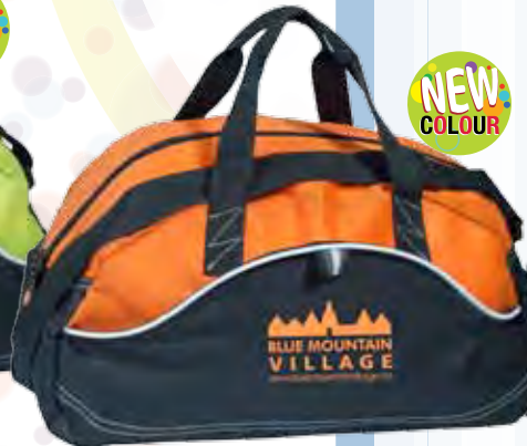
B140OR | Orange