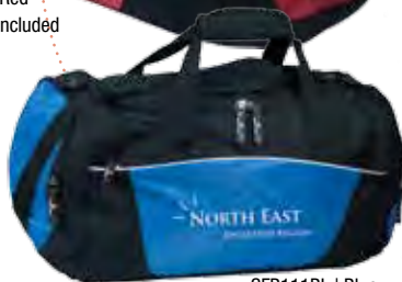
SFB111BL | Blue