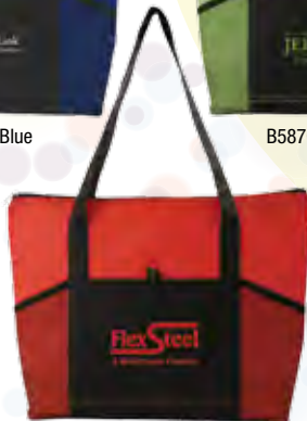
B587RD | Red