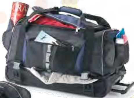
B223 | Blue Accessories Not Included