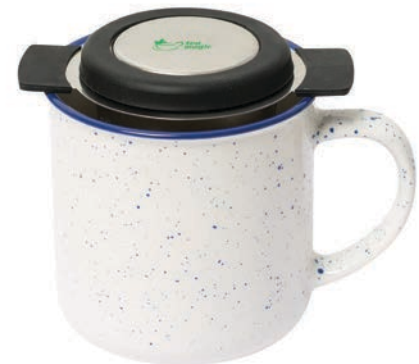
Mug not included