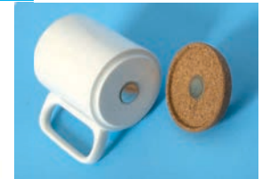
Removable magnetic cork base for washing