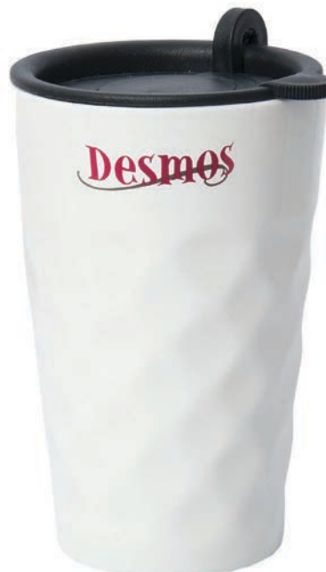
The outside is dimpled just like a golf ball