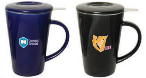
Tea infuser included