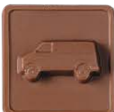
42 - Van