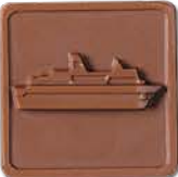
14 - Cruise Ship