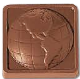
17 - Globe