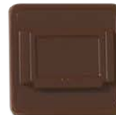
36 - Television