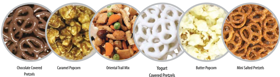
Large Savory Snack Tube