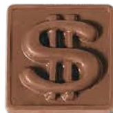
15 - Dollar Sign