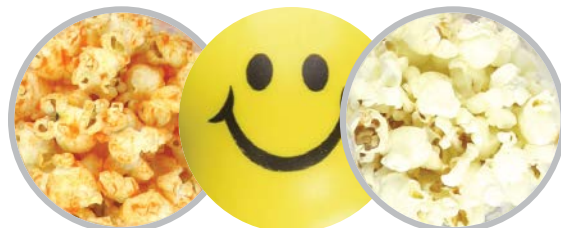
Small Stress Relief Popcorn Tube