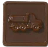
16 - Dump Truck