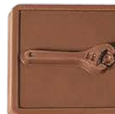
43 - Wrench