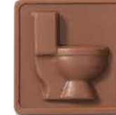
38 - Toilet