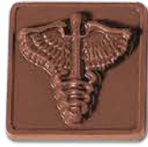
8 - Caduceus