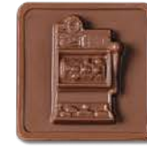
33 - Slot Machine