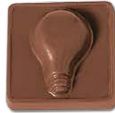
24 - Light Bulb