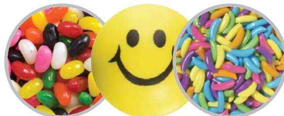
Small Stress Relief Candy Tube