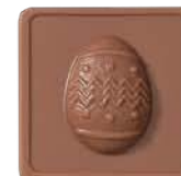
50 - Easter Egg