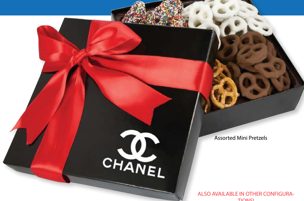
Assorted Mini Pretzels

Holiday Confections include: Peppermint Bark, Twist Wrapped Truffles, Milk Sea Salt Caramels, and Dark Sea Salt Caramels.