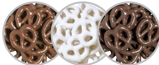
Small Pretzel Tube