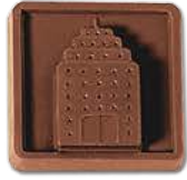
7 - Building