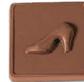
31 - Shoe