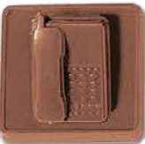
35 - Telephone