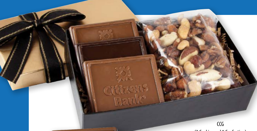
CCG (3 Cookies and 1 Confection)