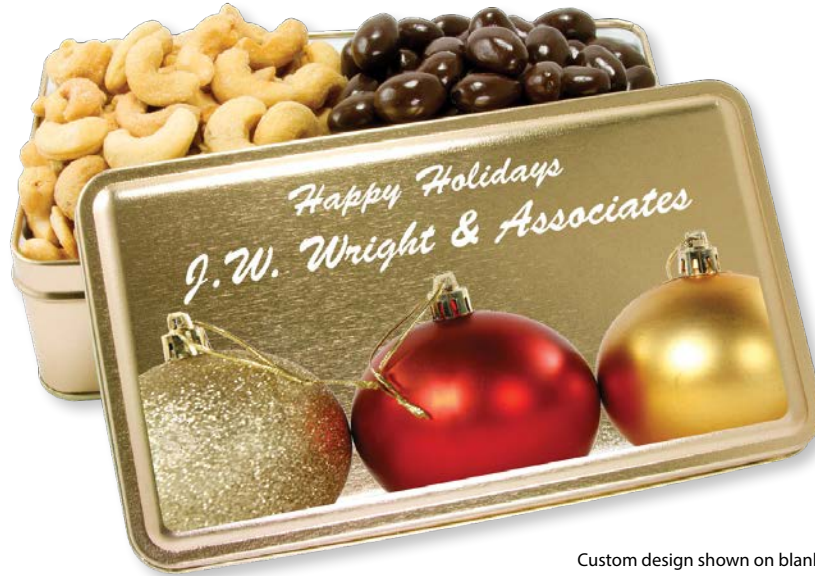
Custom design shown on blank tin