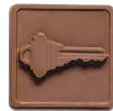
23 - Key