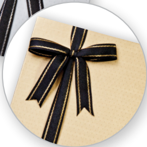
Your choice of a gold or silver window box with matching black/gold or black/silver ribbon.