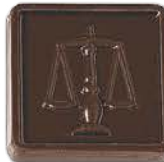
29 - Scales of Justice