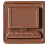
12 - Computer