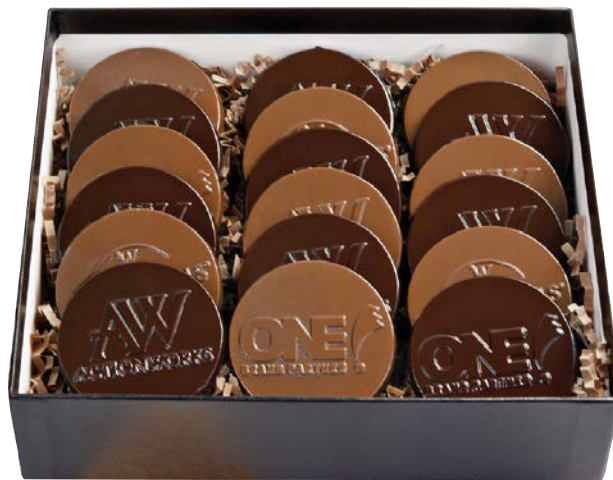
CFB-R (18 Cookies)