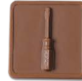
30 - Screwdriver