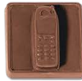
10 - Cell Phone