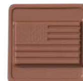
51 - US Flag