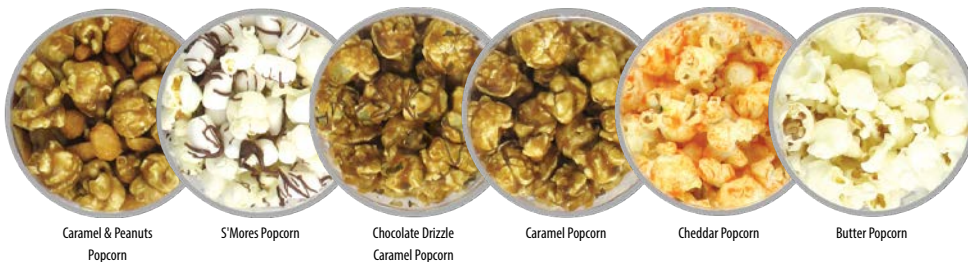
Large Popcorn Tube