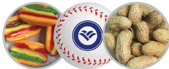
Small Sports Tube