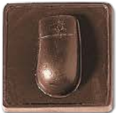
13 - Computer Mouse