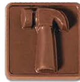
18 - Hammer