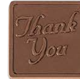
37 - Thank You