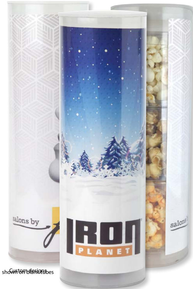
Custom designs shown on blank tubes