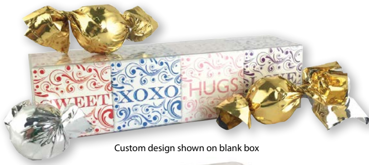
Custom design shown on blank box