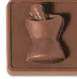
25 - Mortar & Pestle