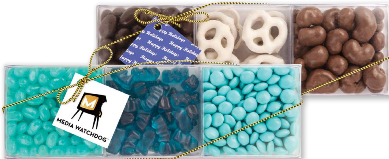
Gourmet Jelly Beans