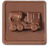
11 - Cement Mixer