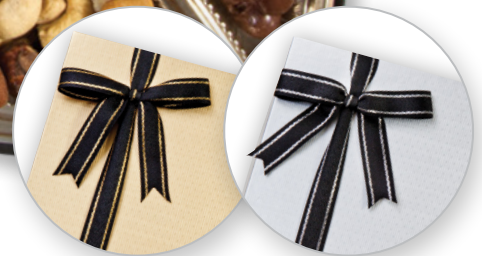
Your choice of a gold or silver window box with matching black/gold or black/silver ribbon.