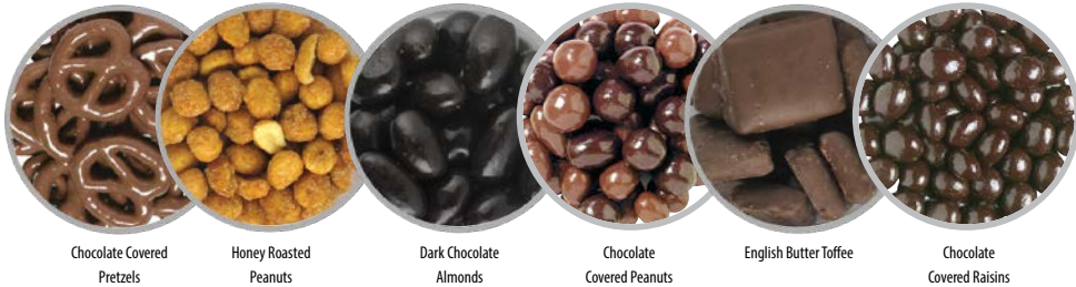
Large Nuts & Sweets Tube