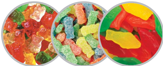
Small Gummy Tube