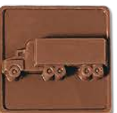
41 - Truck