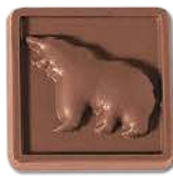
6 - Bear