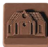
22 - House