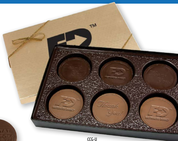
CCG-U (6 Round Cookies)