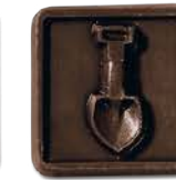
32 - Shovel