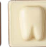
39 - Tooth