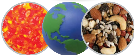
Small Energy Tube