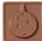
46 - Ornament