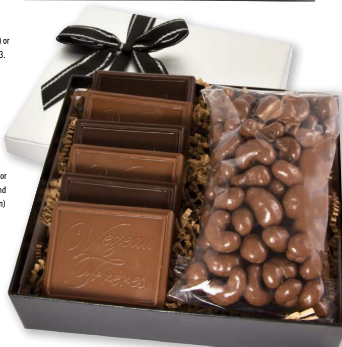
CFB (12 Cookies or 6 Cookies and 1 Confection)