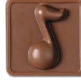
26 - Music Note