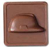
20 - Hard Hat