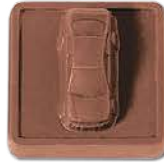
9 - Car