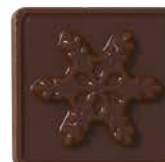
47 - Snowflake