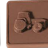
40 - Tractor