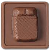
3 - Bed