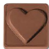
21 - Heart