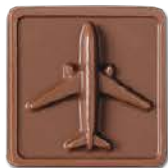
1 - Airplane