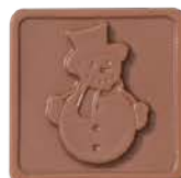
48 - Snowman