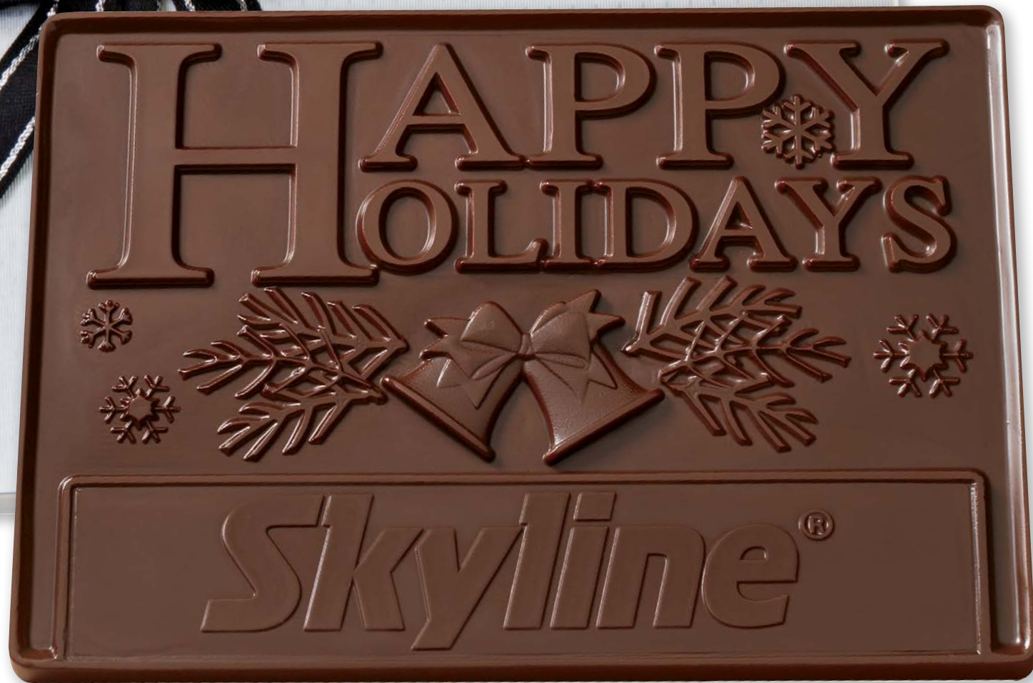
EC6C with 3D Happy Holidays Design