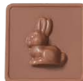
49 - Easter Bunny