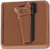
28 - Saw