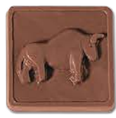
5 - Bull