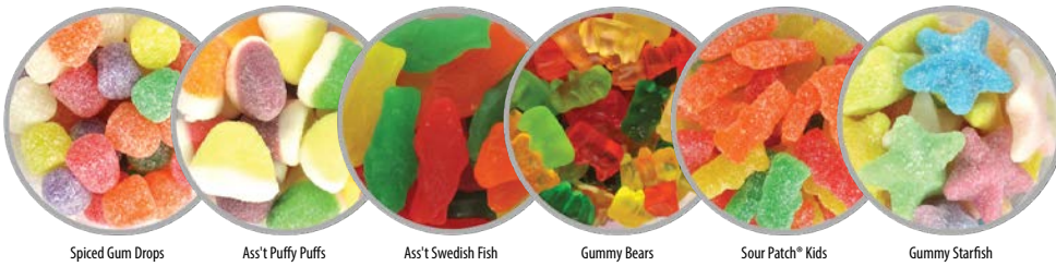
Large Confections Tube

Imprint Area: 17" H x 7 3/8" W Re-Order Setup Charge: $35.00 (G) Packed: 12 per 18 lbs. (8 kg) case