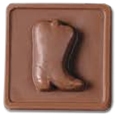
4 - Boot