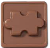
27 - Puzzle Piece