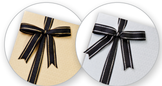
Your choice of a gold or silver box with matching black/gold or black/silver ribbon.

Our 2 pound 3D bar makes a stunning gift. Use our stock Happy Holidays or Season's Greetings designs and place your logo in the rectangle as shown. Each bar is packaged in a gift box with a coordinating bow and optional foil stamped logo on the lid. For an additional charge, enhance the gift by including an imprinted hammer to help break the bar.