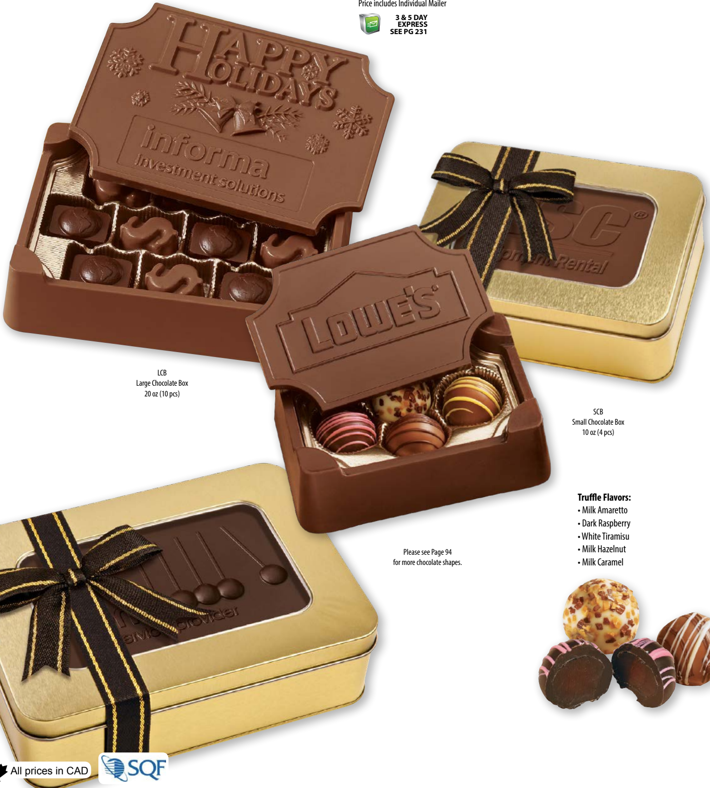
LCB Large Chocolate Box 20 oz (10 pcs)