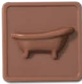
2 - Bathtub