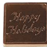
19 - Happy Holidays