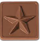
34 - Star