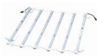
Section of 1x1