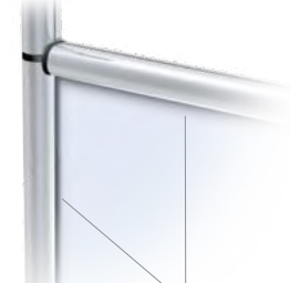
Enclosed by channel