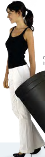
OPC-1 Podium Case, hard plastic, casters.