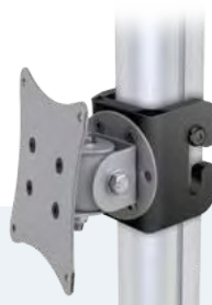
Universal Monitor Mounts