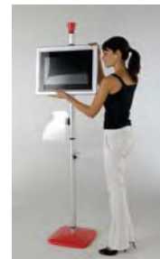
Quick, Easy Assembly