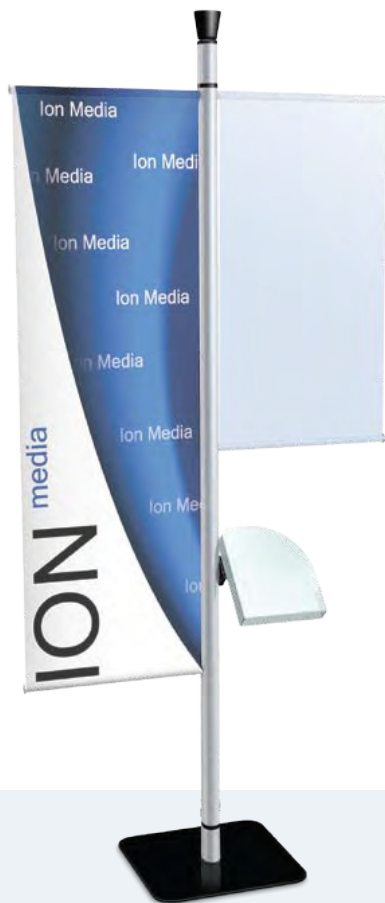
Stylish Aluminum Sign Frame.