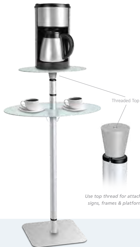
Tool Free Assembly

Use top thread for attaching signs, frames & platforms.