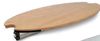
CRPB Birch platform with integral crossbar.