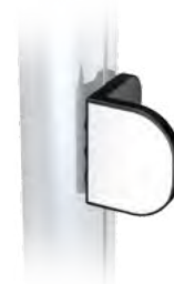
Hook/Loop Angle Backs