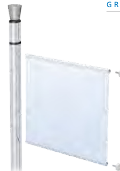
Graphic Rods with face out discs.