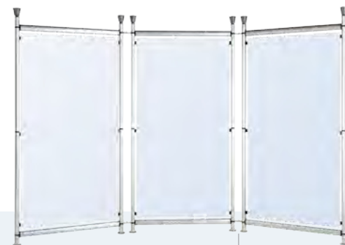
Steel Set Joiners